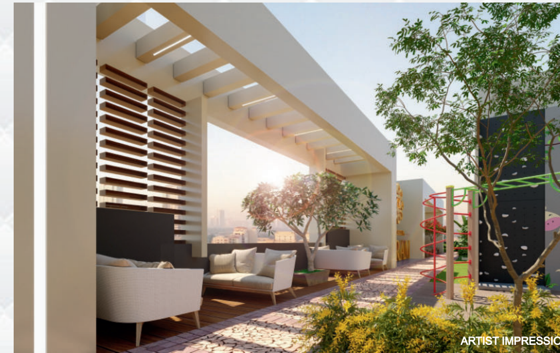
Senior Citizen Corner