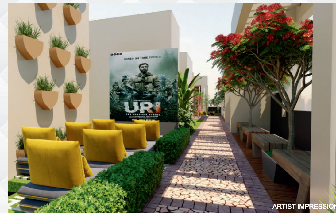
Open Air Amphitheatre

SOOTHING VIEW FROM EVERY CORNER OF YOUR HOME