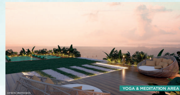
YOGA & MEDITATION AREA

The beauty and luxuries of Gurukrupa Nigam, a 16 storey tower which is beyond your imagination. With scenic garden facing residences. Gurukrupa Nigam is an ideal place for those who are looking for an eco-friendly and green environment. Breathe in the healthy air of the surroundings & enjoy the scenic beauty, something that is a rare in Mumbai. Time to go green.